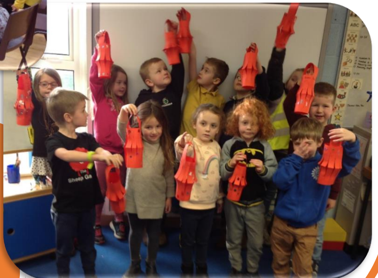
Some pictures of recent activities in the Primary 1-3 class.